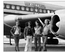
Sex Pistols, John Lennon Mick Jagger, Led Zeppelin