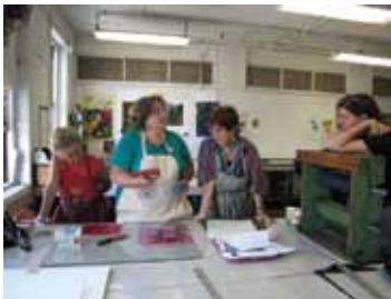
Polyester litho class 2010