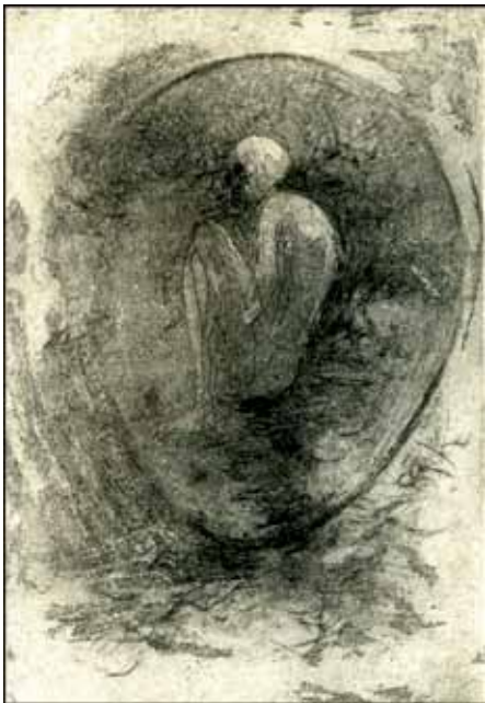
Egg Man 7 x 5 inches etching / drypoint / aquatint

I try to combine the spontaneity of a quick drawing with the strength of a carefully conceived composition to create images rich in tone and texture.