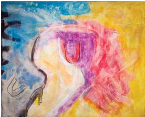
Provincetown Kafka 15 x 20 inches silk plate monotype

my work is something that shakes you gently soundly waking sleeping and deeply happening simultaneously with tapping >> all those states between and moving awareness in the present tense >> churning life experiences up something that wakes you and makes you aware of layers of consciousness operating in and between you and it reaches until it is what makes you breathe in and out and then being or until >> coming together into a waking awareness.