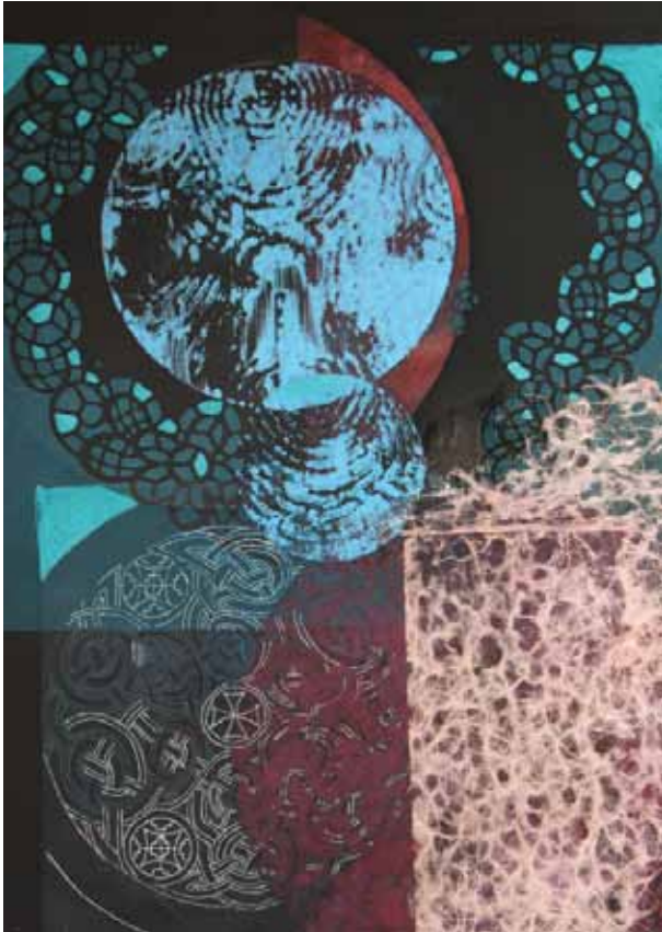
Monotype 11 15 x 22 inches