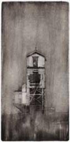
Loading Dock 10 x 5 inches aquatint

As an artist my primary concern has been to express an emotional response to particular locations.