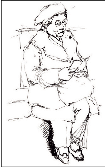
Woman Reading 9 x 6 inches drypoint