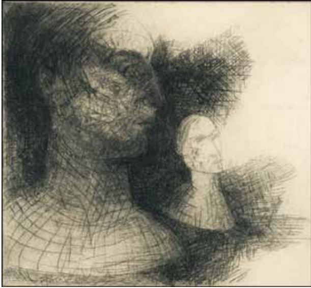
Two Mannequins 7 x 7 inches etching / drypoint