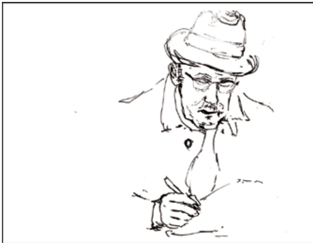
Man Writing 8 x 6 inches drypoint

To scratch into a plate is like scratching into a wall of a cave. 30,000 years ago our ancestors upon cave walls gave us most amazing drawings, showing us not only the scene and the feeling of the moment, but the very nature of movement. In homage to these ancient artists, I have made a number of prints which have been inspired by people in the city, in subways and cafes, on the beach. Through my work, I want these people to be remembered, and like those ancient artists, to convey my respect, and affection, patience and calm hope.