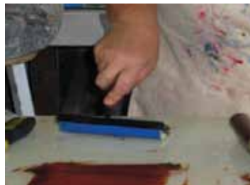
Gum Arabic transfer 2010

Since 1970, the Westbeth Graphics Studio has been a communal printmaking studio for Westbeth artists.