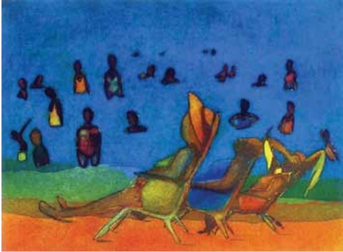
Brighton Beach Bathers