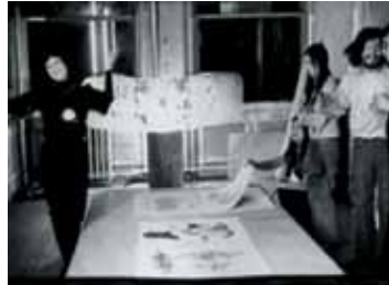
Hiro Morimoto exhibition