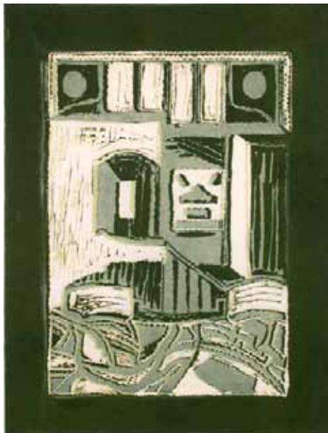
Villa Turque 9 x 12 inches

My Linoleum Reduction prints are about the layering of color and design that is created with each cutting. The positive negative space is created with color and paper as ground and how they work together. The cutting depends on the tools, and the nuances of texture it creates. My Collographs also explore my interest in texture using a variety of materials and how they relate to each other.