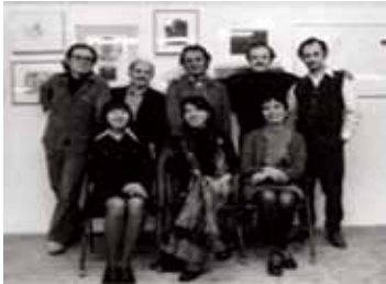
Printmakers Show 1973