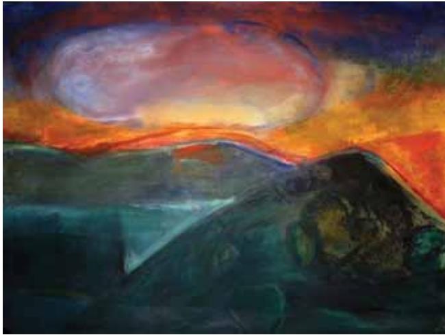
Mountain Lake 22 x 30 inches encaustic monotype