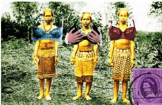
Dayak Women Postcard #1 6 x 14 inches polyester litho

In my work, the radiant world is integrated with issues of landscape and feminism shaped by a heritage of spirit stories from Trinidad and the hunt narratives of the Kadazan Dayaks. Color, form, material and technique are distilled within this atmosphere.