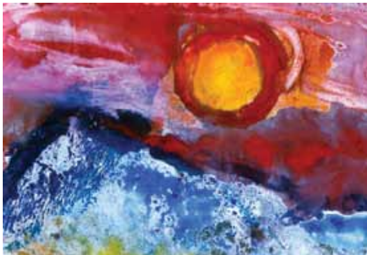
Mountain Sun 22 x 30 inches encaustic monotype /watercolor

Through a vision that transforms time and place, relating inner states with outer realities, I use observation, memory and imagination to explore the poetics of imagery. By moving between figuration and abstraction, a mystery and presence can be found.