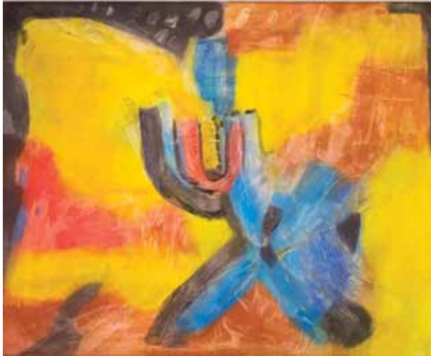
Provincetown Kafka 15 x 20 inches silk plate monotype