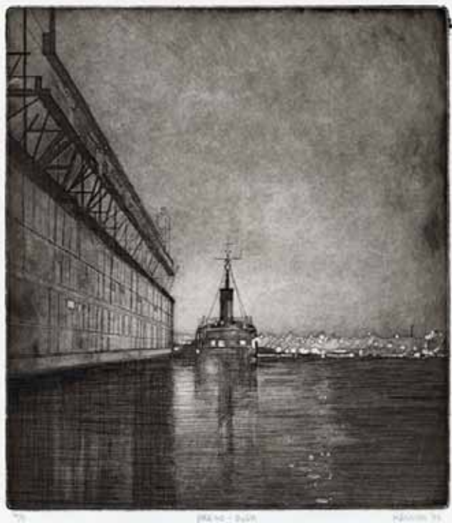
Pier 40, Dusk 10 x 9 inches aquatint