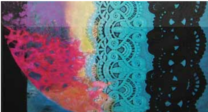
Monotype 12 16 x 22 inches

I have been a working artist for 25 years. Over the years, I have been interested in experimenting with a lot of different materials, to see what type of effects I can achieve, and use them in combination to make use of the most interesting compositions I can come up with, on many levels. In these prints, I use monotype, etching, linoleum cuts and chine colle. I incorporate Japanese, African and Celtic fabric patterns, wood grain, lace, and various sea forms.