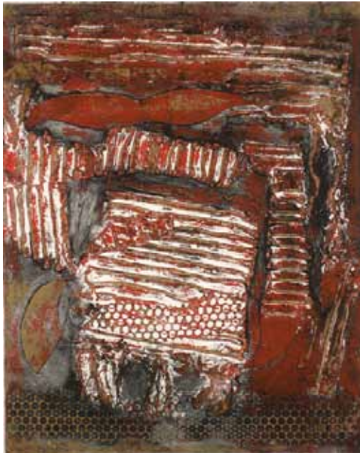
Texture Collograph 11 x 12.5 inches