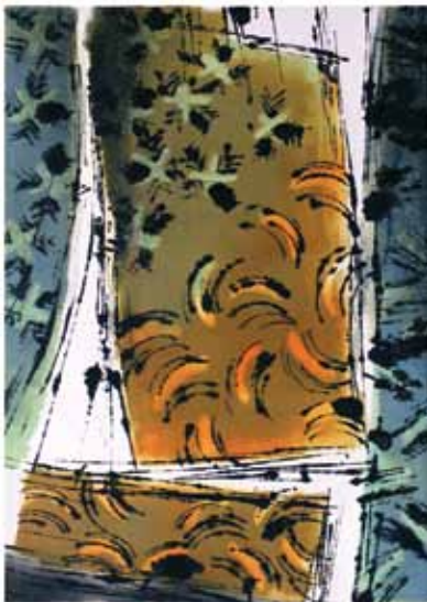
In Between monoprint

In printmaking, I often use symbols and believe in their ability to transform, to guide and empower the body and spirit. This process enables me to adapt and discover intuitive solutions in unending variation. Based on life experience, this becomes a conversation with myself through art. Printmaking, for me, offers the potential of unplanned release of energy when seen through symbols' visual impact.