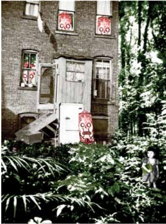
Shield House 11 x 14 inches polyester litho